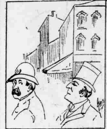
SCENE I.—"Mr. Policeman, can you tell me what street this is?"