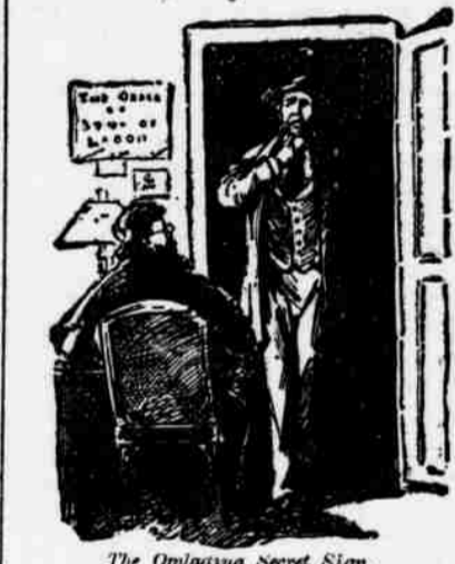
The Omladina Secret Sign.

chief arranges for the commission of the deed, and dispatches the murderous emissary upon his fatal errand.