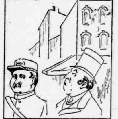
SCENE IV.—"Pstman, can you tell me what street this is?"