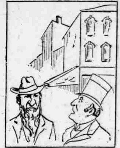
SCENE III.—"Can you tell me the name of this street, sir?"