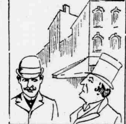
SCENE II.—"Do you know the name of this street, please?"