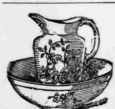
$3.95 For the new "World's Fair" Toilet Set of 12 pieces; including slop jar; novel decorations in all colors; regular price $7.50.

$10.50 For an extra fine Porcelain fold Eand Dinner Set of 112 pieces; each piece warranted free from do ects; regular price $25. $16.50 For those celebrated and much admired Carlsbad Transparent China Dinner Sets of 110 pieces; artistically decorated in different designs; regular price 835.