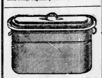
59c A WONDER! Only 59c for No. 8 Heavy Wash Bollers; very dura-ble and strong; regular price $1 25.

25c For large, tempered steel Scissors (plain, buttonhole, embroidery or pocket); regular price from 50c to 75c. 18¢ For a beautiful Child's Set (silver-plated knife, fork and spoon, in a nice box); regular price 50c.