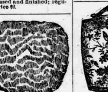
5c For extra large size sheep Wool Sponges; nice and soft; just right for the bath; regular price 20c.

58c For extra heavy, best quality Asbestos Fire backs; regular price 98c. $1.18 For Solid Brass Fire Fronts: handsomely embossed and finished; regular price $2.