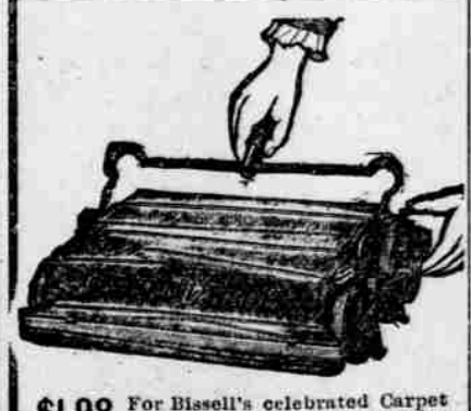
For Bissell's celebrated Carpet Sweepers (best made): regular price $3.