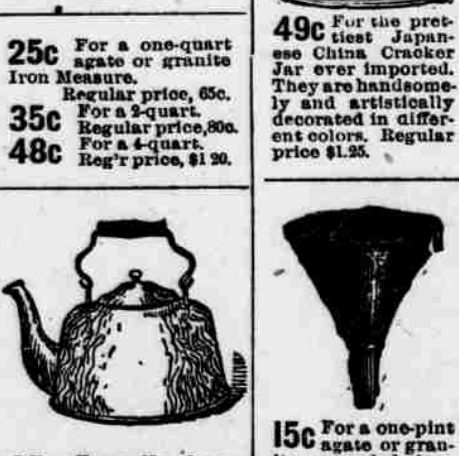
95c For a No. 8 ag-ate or granite en-ameled fron Tea Kettle. Regular price, $2 30.

25c For a one-quart agate or granite Iron Measure. Regular price, 65c. 35c For a 2-quart. Regular price, 80c. For a 4-quart. Reg'r price, $1.20.