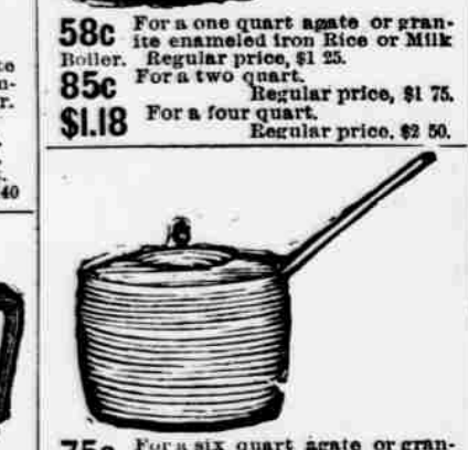
75c For a six quart agate or gran-ite enameled ironConvexSeam-less Cook Pot. Regular price, $1 60.