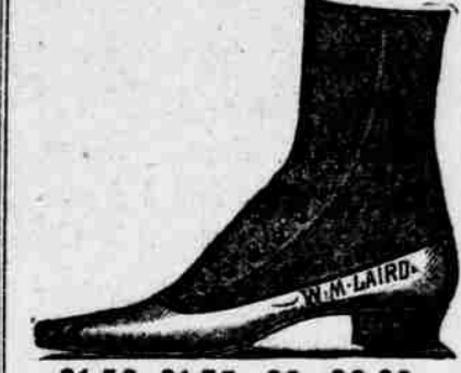
$1.50, $1.75, $2, $2.90.

Children's Cloth Top Dongola Pat. Tip Spring, 99c, $1.18, $1.25, $1.50. Misses' Cloth Top Pat. Tip Spring Heel, $1.25, $1.50, $1.75, $2.