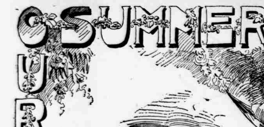
THE WAVES OF HUMANITY THAT ROLL EASTWARD TO MEET THE COOLING WAVES OF OLD NEPTUNE...

THE WAVES OF HUMANITY THAT ROLL EASTWARD TO MEET THE COOLING WAVES OF OLD NEPTUNE... More frequent and higher last week. They broke into white caps at Atlantic City and Pittsburgh faces were on the crests.