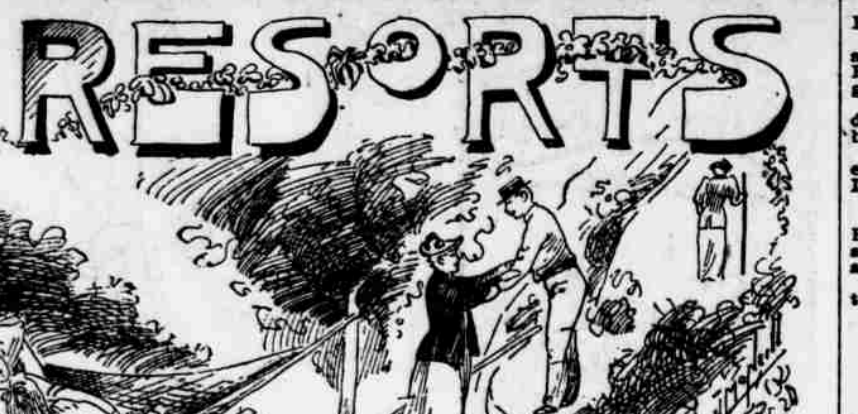
WHERE THE INVALIDS GO. Lots of Fun at Gay Ma. Clemens in Spite of the Sick Folks—Fishing on the Lake—How a Pittsburgher Put in His Time There.