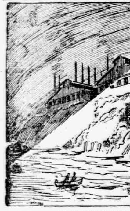
THE SEARCH LIGHT ON THE WATER TANKS.

HOMESTEAD, July 2.—To-day 22 of the 23 barracks located within Homestead have been closed at the comparatively early hour of 8 in the evening.