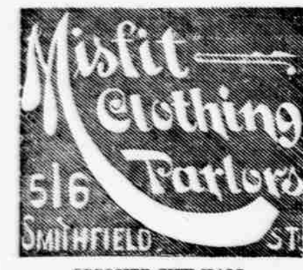
OPPOSITE CITY HALL

For any of our Trousers that were originally made up to order for $10.