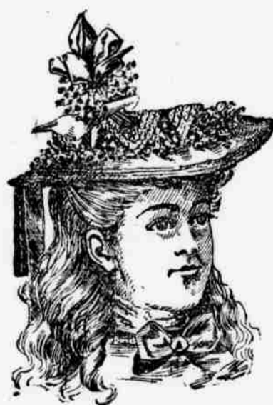
"THE CHILD'S BOULEVARD."