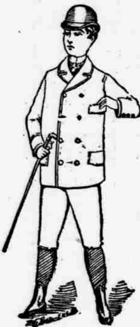
$5.00 WORTH $7.75.

A PERFECT BEAUTY. This line of Suits consists of every handsome pattern imaginable.