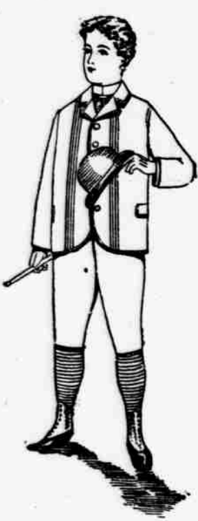
$2.75 WORTH FIVE.

Consequently extend your patronage to a house that has adopted the SMALL-PROFIT SYSTEM. READ AND BE WISE. What we offer in Children's Suits from 4 to 15 Years of age: