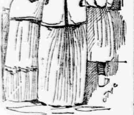
Harbingers of Spring.

The plows, covered with dust, are brought out from the barn and made ready for use. Even the old straw hat is not forgotten in the garner, and is resurrected to