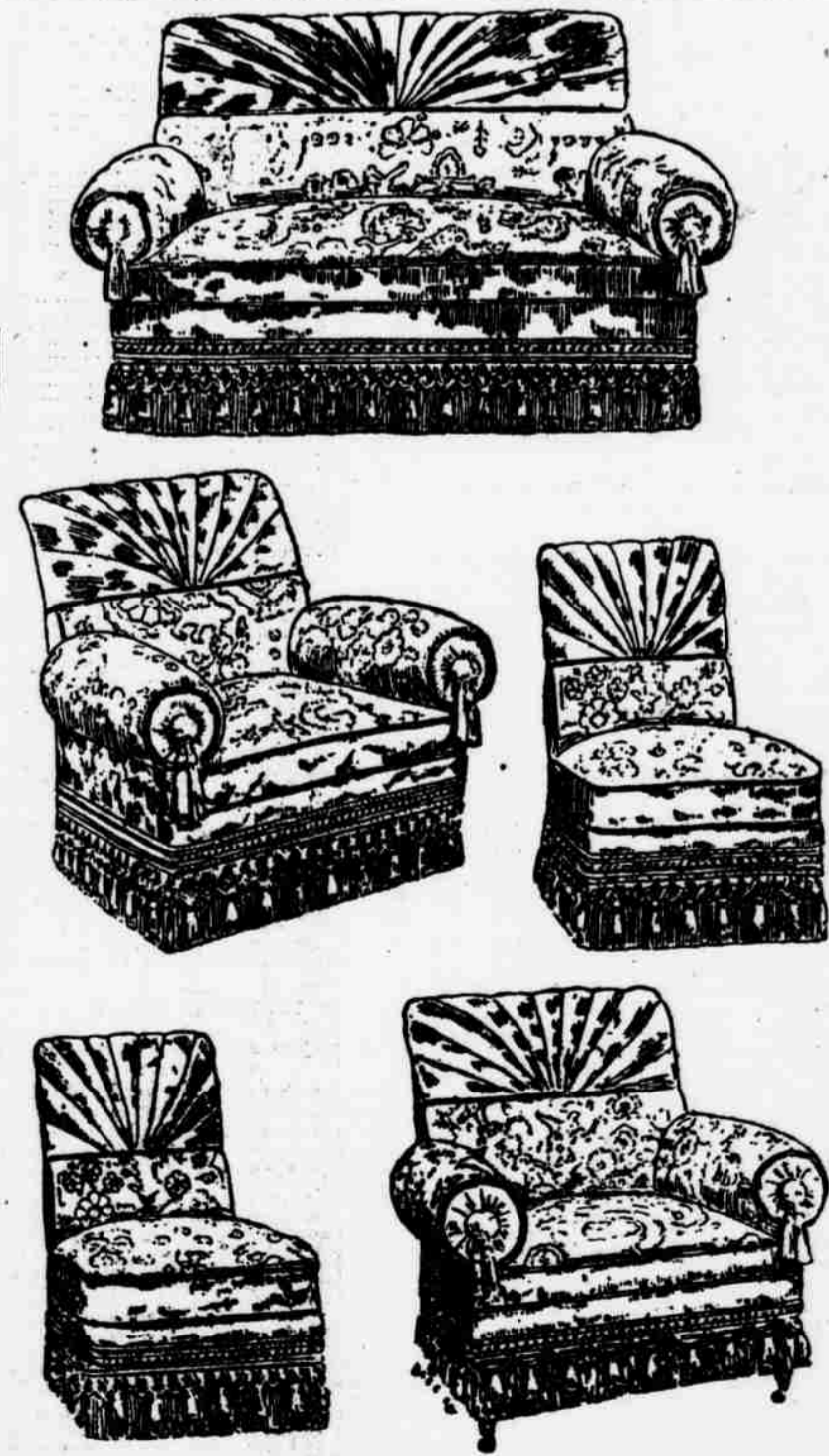
A GLIMPSE INTO PARLORDOM.