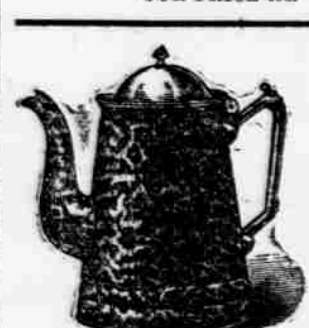
FANCY TEA POTS.

1 quart; regular price 80c; OUR PRICE 40c. 2 quarts; regular price $1; OUR PRICE 65c.