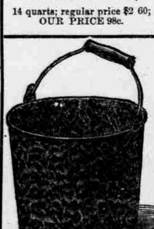
SEAMLESS WATER PAILS. 12 quarts: regular price $1 40; OUR PRICE 70c. 15 quarts: regular price $1 65; OUR PRICE 83c. 20 quarts; regular price $2; OUR PRICE $1.