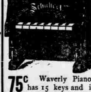
seat and back; made very strongly; regu-

75° Waverly Piano, has 15 keys and is nicely finished and strongly made; regular