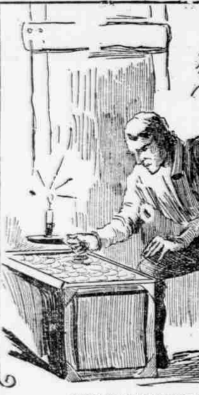
WHEN HE WAS HUNGRY HE FINGERED HIS GOLD.