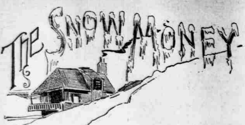
TRANSLATED FOR THE DISPATCH.