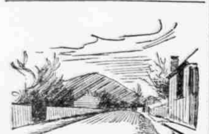
MACADAMIZED ROAD AFTER A YEAR'S TRIAL.