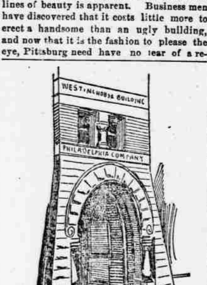
Philadelphia Company's Building.