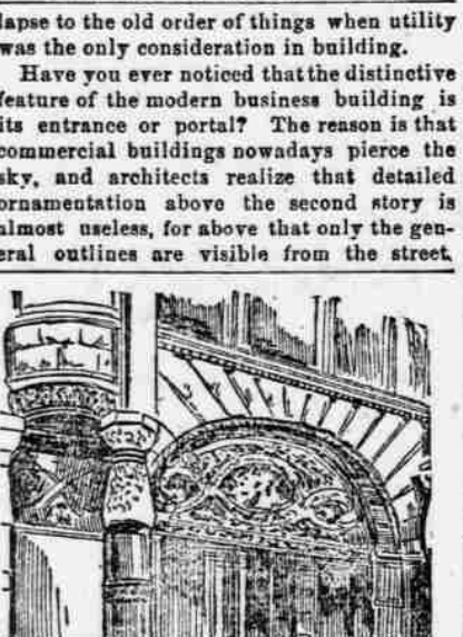
The Hussey Building.