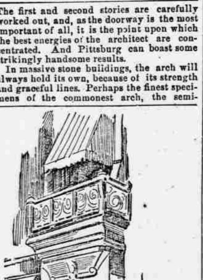
The Lewis Block.