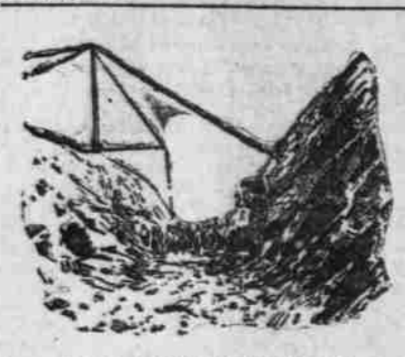
East End Folk's Steam Tunnel.

The doctor treats chronic diseases and deformities only, and uniform success results from his superior skill and improved methods. RUPTURE, HERNIA or BILIEAE, or any of the various diseases of the stomach, liver, bowels, etc., can be cured in 30 to 60 days under treatment by the new method of Dr. Woods.