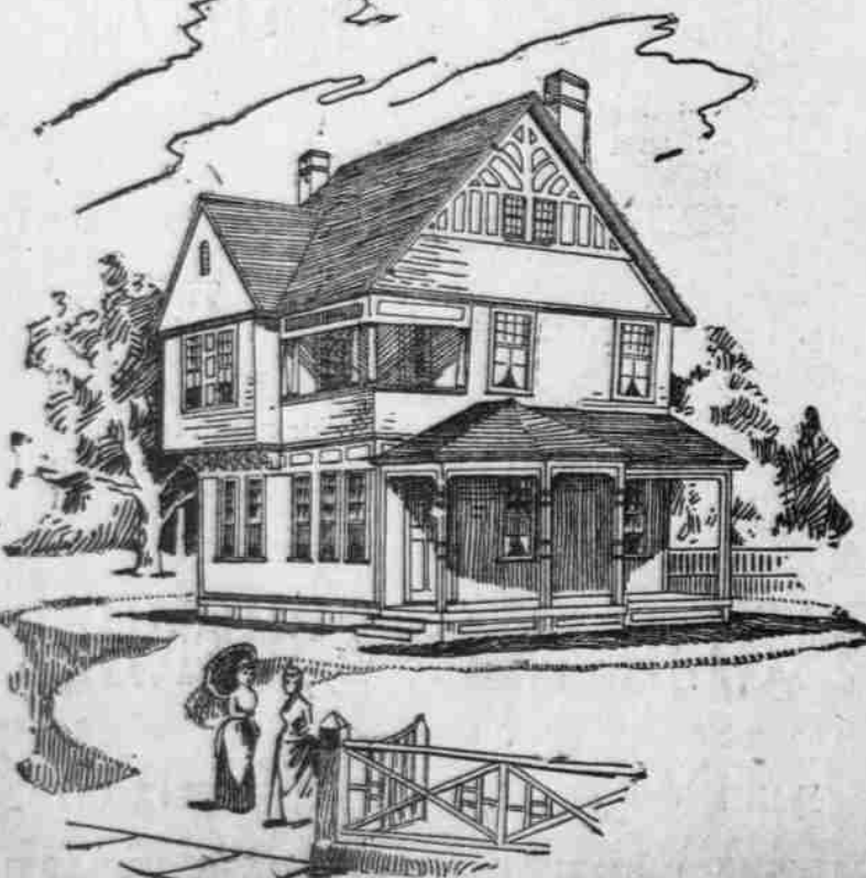
A house we build and sell on Monthly Payments about equal to rent.

As a matter of fact our cheapest lots are inferior, consequently we only wish to sell them to those who have an opportunity to examine them and judge for themselves. But, to all wishing $150 to $200 lots, who inclose $1.50 to $2 for first payment, we positively guarantee to give them the very choicest lots remaining then unsold, and still further guarantee that said lots shall be high and dry, need no grading and be as level as a table.