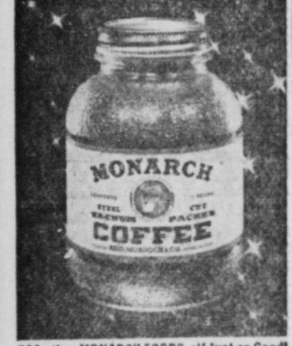
600 other MONARCH FOODS—all just as Good!