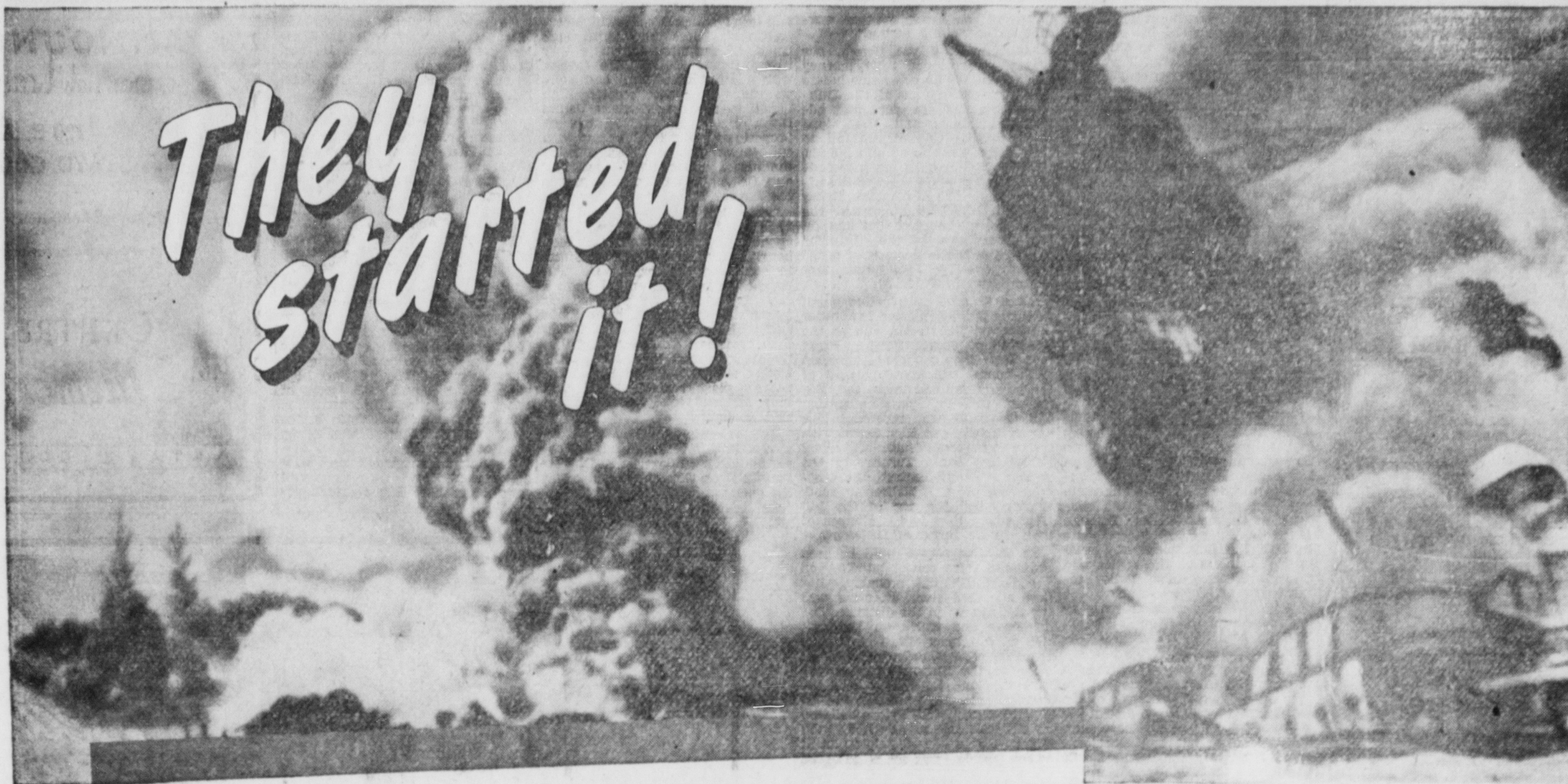
Illustration News, Inc. Copyright 1941—From Acme