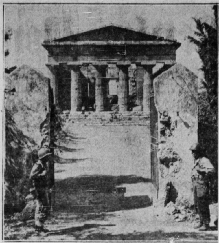
AMERICAN DOUGHBOYS GUARD CLASSIC TEMPLE—More than 2,700 years ago this Greek Temple of Neptune was erected at Paestum, Italy, and stands today untouched by the ravages of war.