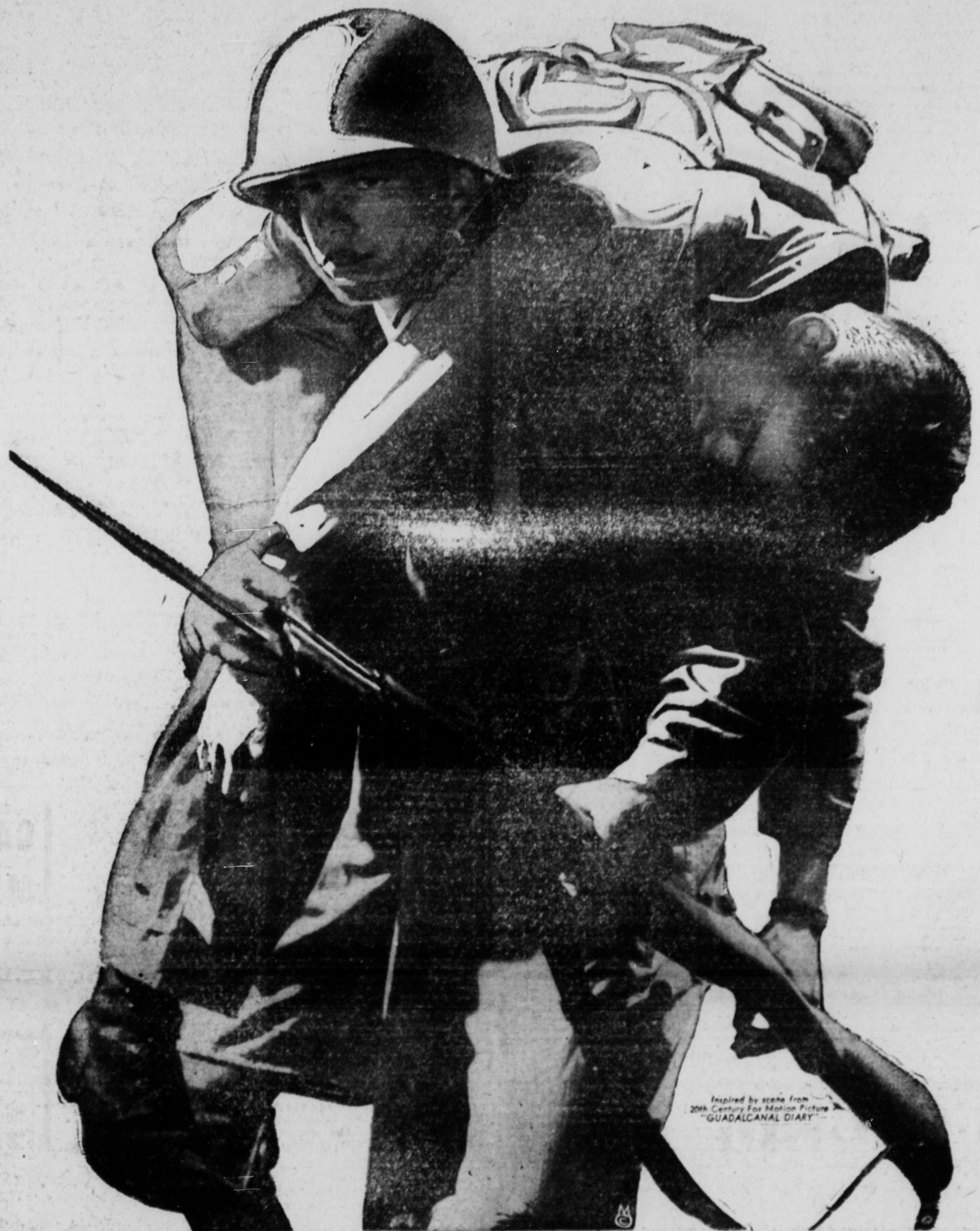
Inspired by scene from 20th Century Fox Motion Picture "GUADALCANAL DIARY"