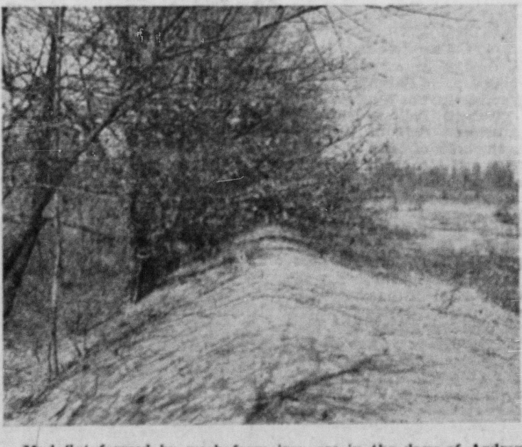
Mud flat formed by wash from iron ore Carnegie.