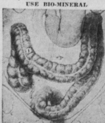
Ptosis — Displaced transverse colon. Caused by improper stomach func-tion, often due to mineral deficiency. USE BIO-MINERAL

Satisfied After 5 Days' Trial. BIO-MINERAL-SPECIAL OFFER! 2 bottles $1.85--3 bottles (65 Day Treatment) $2.75--1 bottle $1