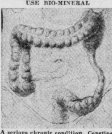
A serious chronic condition. Constina USE BIO-MINERAL