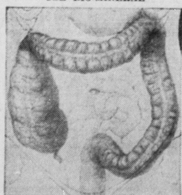
the famous springs in highly-concentrated form. As a logical thing, there should be a bottle A very serious case of an affected ascending colon. Important! — Keep the colon clean and healthy, Iree from poisonous matter. of BIO-MINERAL in every home to take the place of physics, cathartics, oils and all harmful drugs.