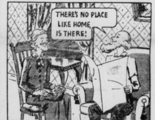
PUZZLE NO. 5