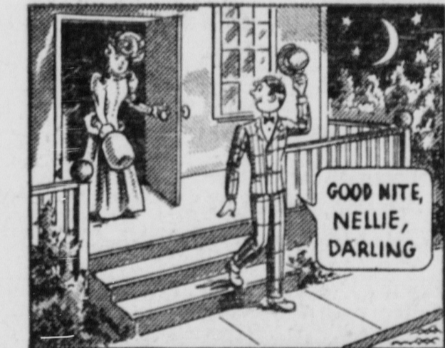
PUZZLE NO. 1