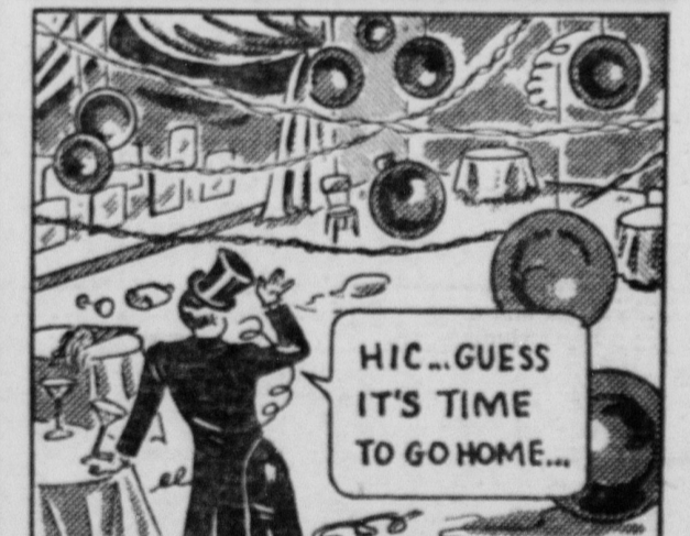
PUZZLE NO. 8