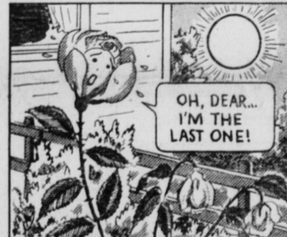
PUZZLE NO. 4