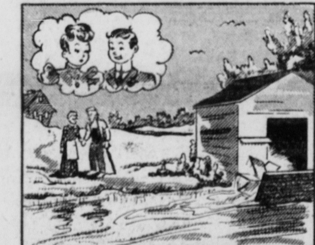
PUZZLE NO. 3