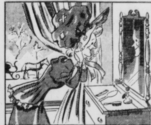
PUZZLE NO. 2