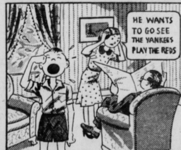
PUZZLE NO. 7