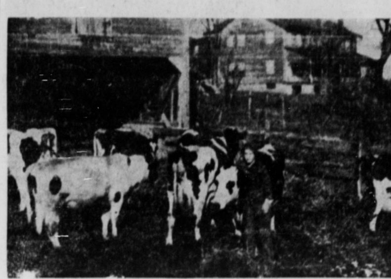
Typical F. S. A. Dairy Herd is Shown Above.