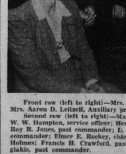
One of the features of the Armistice Day observance at Brooks-Doll Post is the burning of the mortgage on the building.