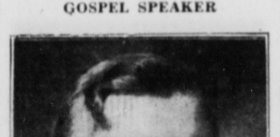
Christian & Missionary Alliance