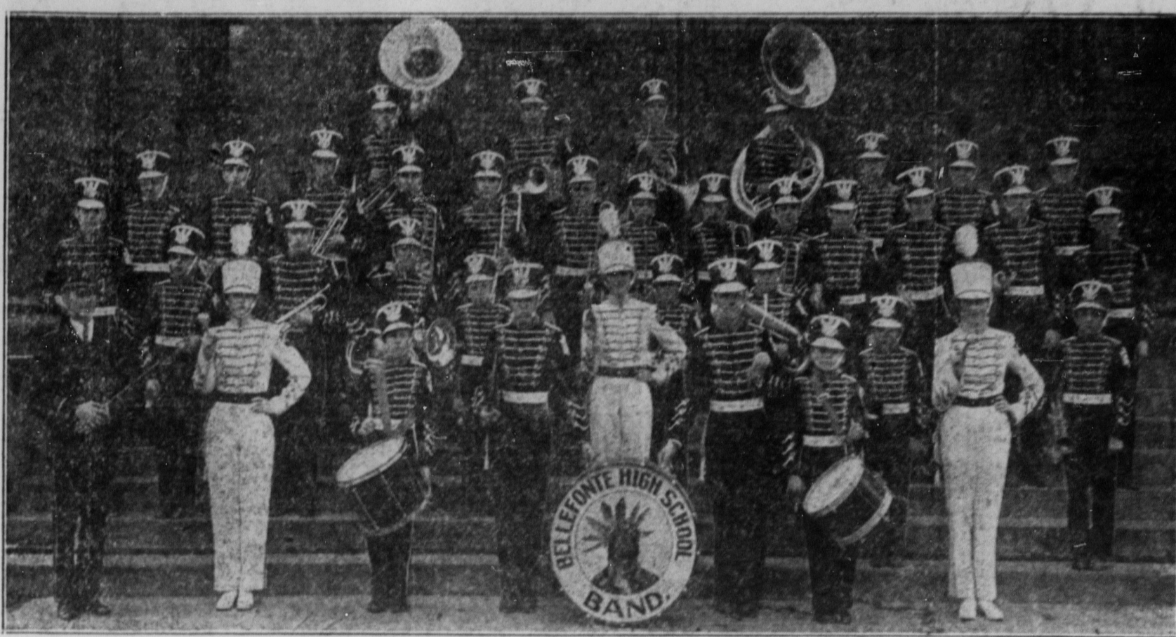
THE BELLEFONTE HIGH SCHOOL BAND