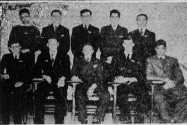
Winners in a farm record keeping contest sponsored in Pennsylvania by the eleven Production Credit Associations and the vocational teachers of the Department of Education are shown above.