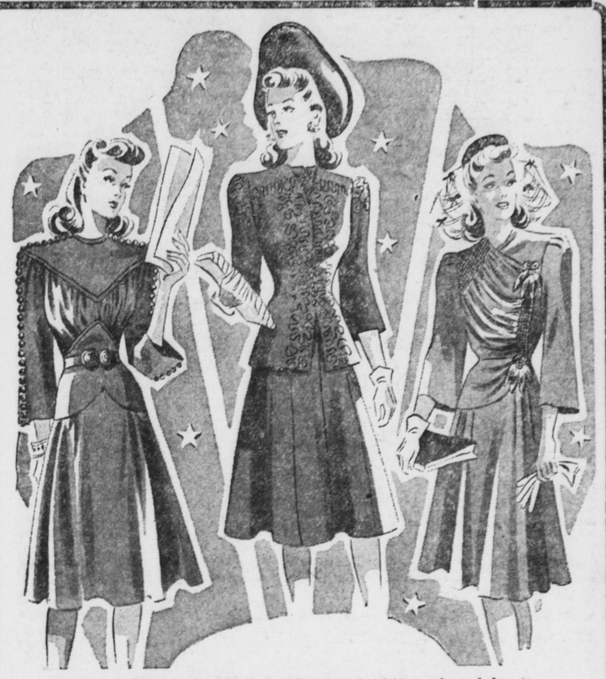
January Clearance Sale! Women's, Misses' and Junior

This is strictly a cash sale to convert merchandise into cash. No charges—no approvals. All sales final.