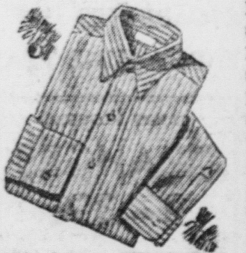
Well tailored shirts increase every man's sense of being smartly dressed. We feature many patterns, priced at