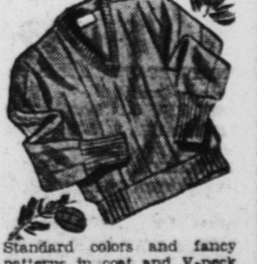
Standard colors and fancy patterns in coat and V-neck sweaters. We have them at all prices from