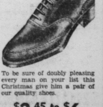
To be sure of doubly pleasing every man on your list this Christmas give him a pair of our quality shoes.