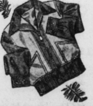
He'll enjoy this leather jacket combining capeskin and suede. It slide-fastens, has deep pockets and stormproof wrists.