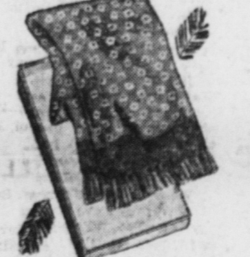
Scarfs in an attractive range of blues, greens, reds, maroons, grays and browns. A real gift for dad or brother.

Whether he's on land or sea, or in the air... or behind an office desk, this Christmas it's wise and thrifty to give him practical gifts to wear. You want to do the practical thing; you want him to be pleased; you want your gift money to be wisely spent... your answer is a gift from LEVINE'S. Listed here are just a few of the many items of clothing for men and boys to be found in our store.