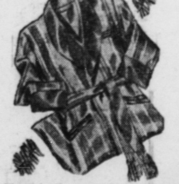
Flannel, silk and Beason robes in every desired pattern. Just the thing to please him this Christmas.