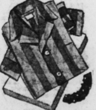
Comfortable, well styled sleeping pajamas in attractive patterns. Broadcloth, madras and silk.