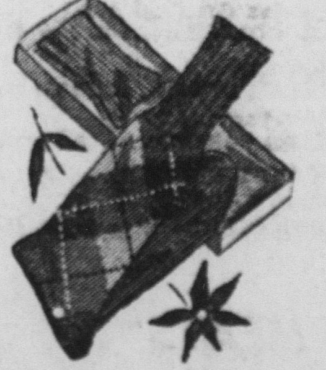
A wide selection of men's fine hose in bright shades of red, green, blue, brown, maroon, patterns.