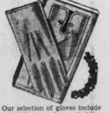
Our selection of gloves include capeskins, mochas, pigskins, suedes, etc. The ideal gift for the man or boy.