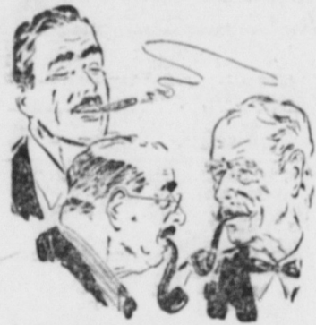
A Complete Line of Cigarettes, Cigars and Tobacco