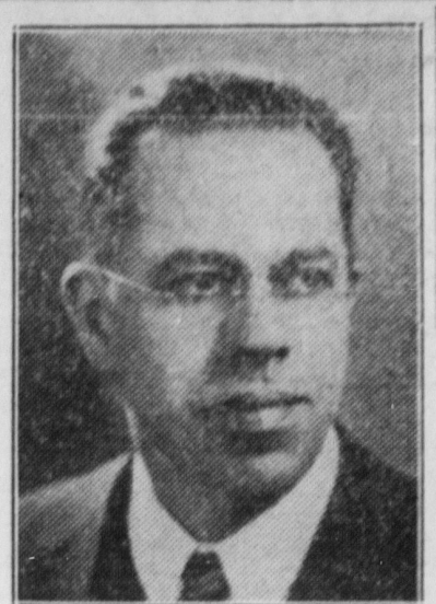
DR. WILBUR E. SAUNDERS

Crude rubber cultivation is the basic economic activity of Liberia, the Department of Commerce reported.