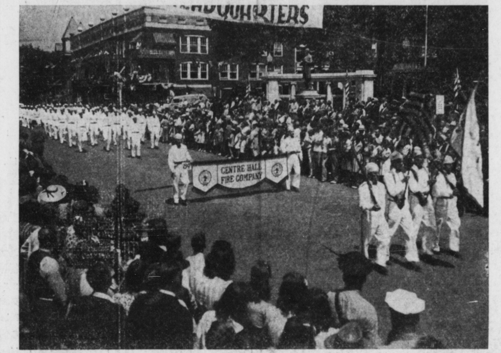
The Centre Hall Fire Company, with 56 uniformed members in line in the parade which climaxed the 49th annual Central District Firemen's Association Convention here last Thursday. The outfit, shown crossing the Diamond, recently won similar honors at Milroy and Howard.