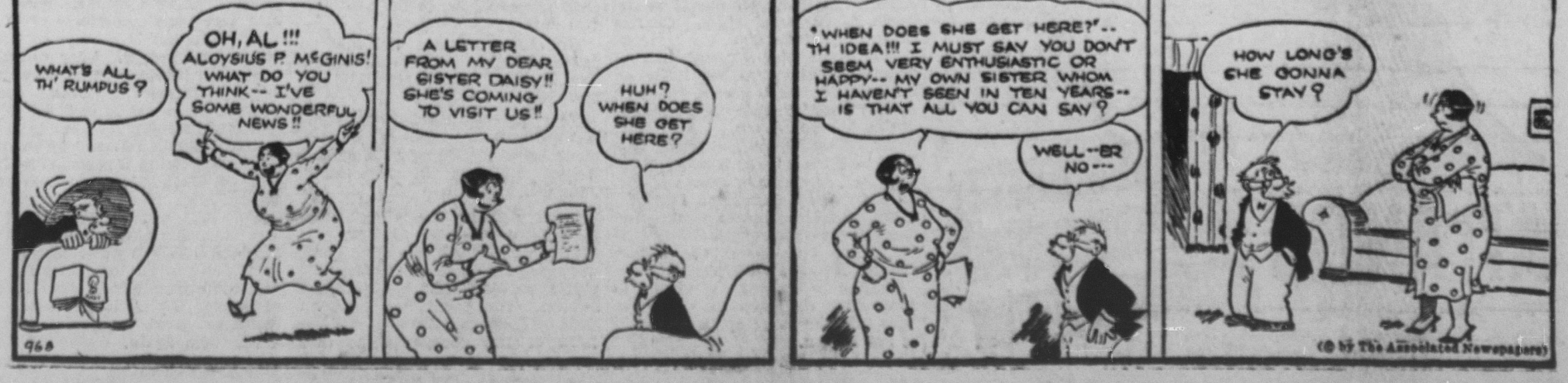
By POP MOMAND