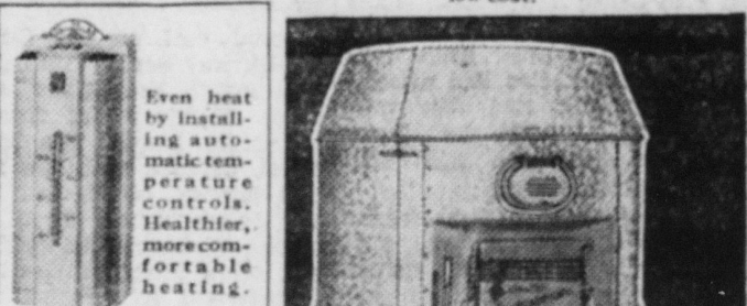
1941 model Kalamazoo Oil Burner takes all the work out of house heating. Automatic, economical operation, low cost.