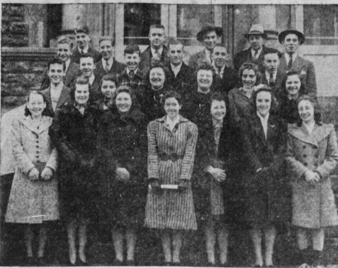
Members of the Senior Class of Walker Township High School, Hubersburg, lined up in front of the Williamsport Sun-Gazette office before beginning a tour of the city's industries Friday morning, an educational feature sponsored by the Sun-Gazette Company. Photo published by courtesy of the newspaper.