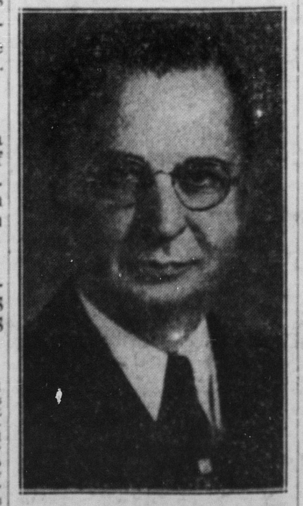
- VOTE -