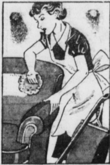
After a thorough cleaning with the attachments of the vacuum cleaner, upholstered furniture may be shampooed with stiff soapsuds.