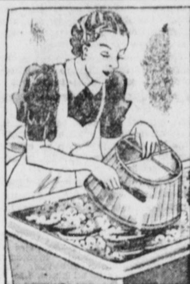
Silk lamp shades can be washed in lukewarm soapsuds—provided they are sewed, not glued to the frames.

Milesburg to Bellefonte A. M.: 6:30, 7:45 and 11:45. P. M.: 1:00, 2:25, 4:25, 5:10, 6:50, 9:15 and 10:15 (the 9:15 trip is on Saturday only).