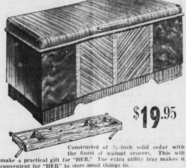
Constructed of 3/4-inch solid cedar with the finest of walnut veneers. This will make a practical gift for "HER." The extra utility tray makes it convenient for "HER" to store small things in.