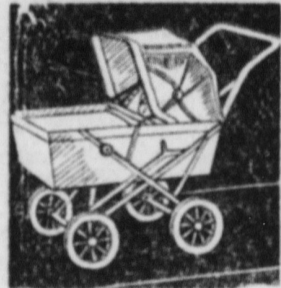
Folding Carriage $4.95

Collapsible folding carriage can be taken anywhere. Large rubber tired wheels. Leatherette hood and body over strong metal frame.