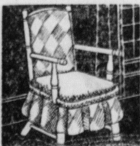
Maple Boudoir Chair $4.95

Sturdy maple frame with checkered cretonne upholstery. Quaint and charming in the bedroom.