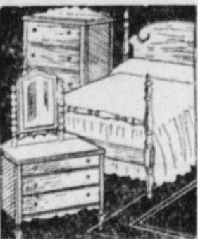
3-pc. Colonial Bedroom Suite $29

Regular $39 suite in mahogany finish. Includes poster bed, chest and dresser.