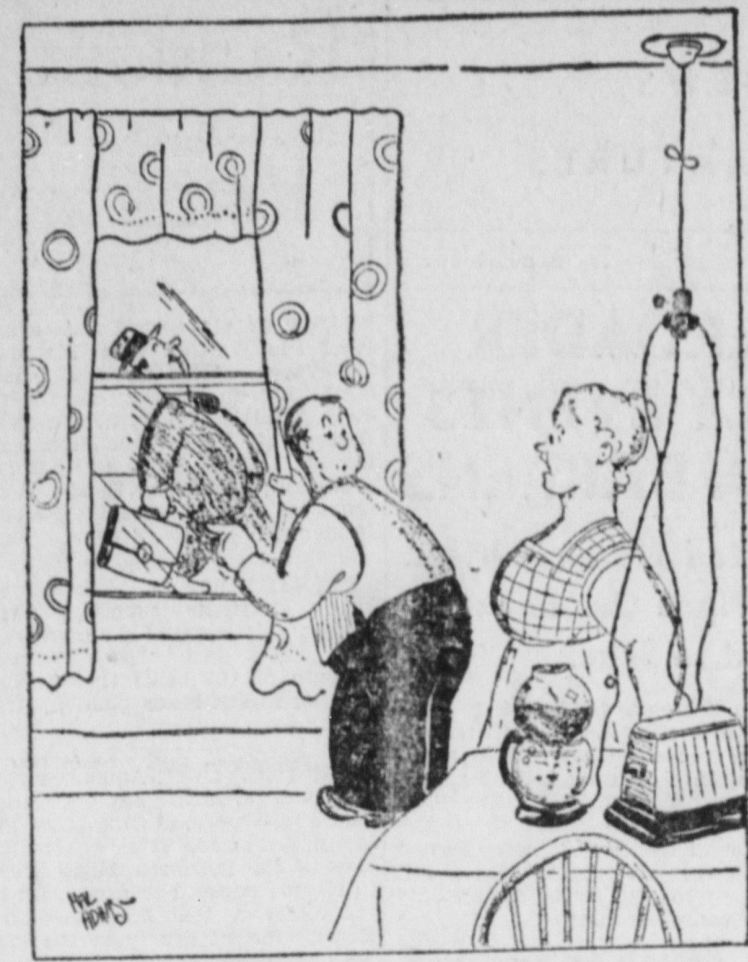
"MAYBE THOSE SMITHS DO USE THE SAME APPLIANCES FOR BREAKFAST BUT THEY HAVE BETTER WIRING!