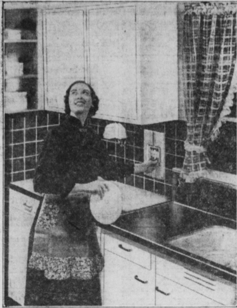
What's the young lady in the picture doing? She's resetting the switch on a circuit breaker panel to restore service after some disturbance. She flips a switch and on go the lights again. These panels are used in many modern home wiring systems.