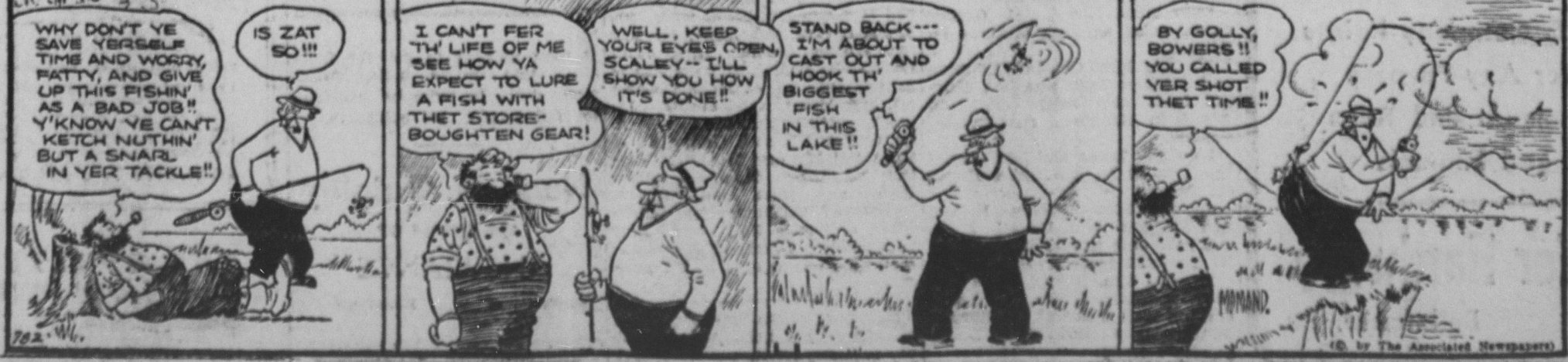
By POP MOMAND