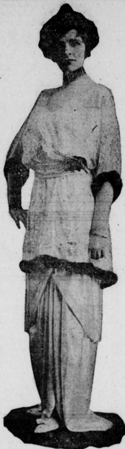
OF CHIFFON, LACE AND FUR.

The holiday season will soon be here, and all kinds of "tango tees" will be "on" for the debutantes of the year and entertainments for the college contingent home for the Christmas festivities. So the girl who is of the butterfly type will be delighted to have mother give her a new evening frock for a Christmas gift.