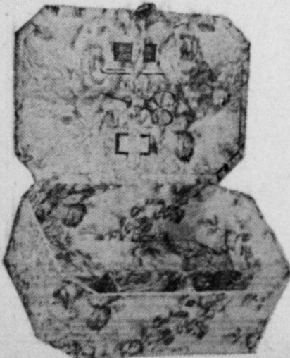
OF BRIGHT COLORED CRETONNE.

Easily constructed is a new model in workbags of the size that is nice to have about the table in the living room. To make it cover with plain silk, a pair of disks of about three inches diameter and shirr about the lower half of each of these the opposite edges of a yard long strip of sash ribbon. This makes a collapsible receptacle with a wide mouth, which may be drawn together by ribbon bangers attached to the top edges of the disks. On the inner side of the pasteboard circles may be affixed flat round cushions for the accommodation of needles and pins, and to the outer side may be suspended scissors and