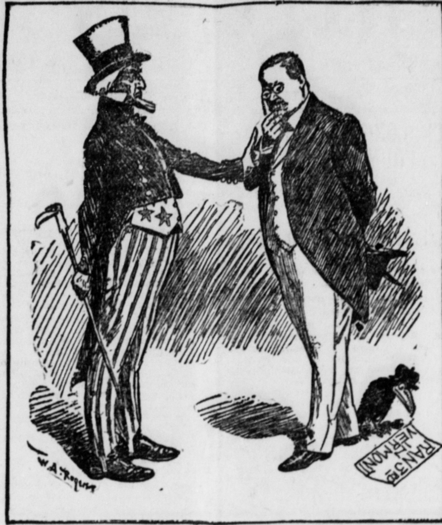
—From the New York Herald.