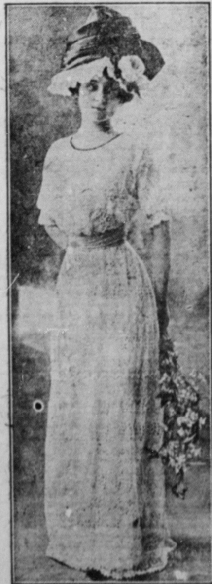
IT'S FRENCH, BUT MAY BE EASILY COPIED

Then if one does not care for ready made clothes there is at present the