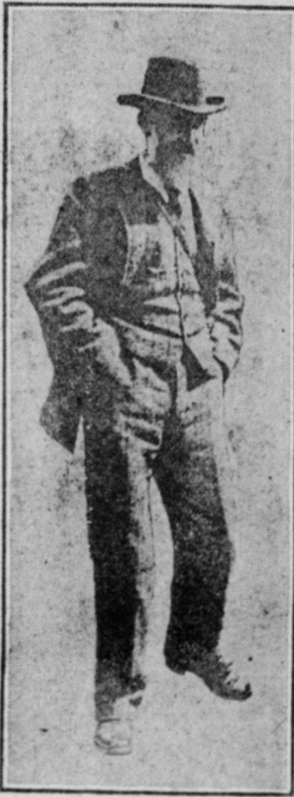
GEORGE BERNARD SHAW

"It was really a fine procession. I saw it. But, while the women had an unusual average of good looks, the policemen's horses were much better looking. I suppose that was because