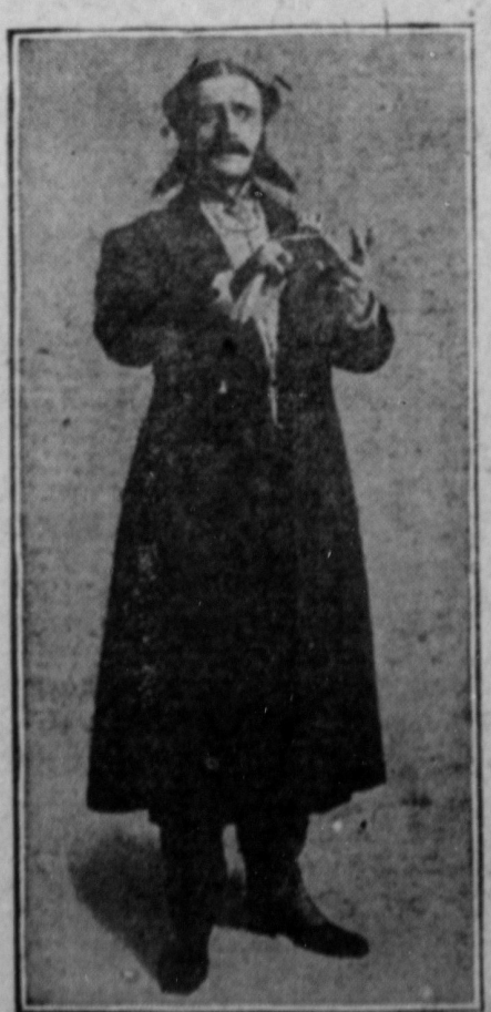
E. H. SOTHERN AS DUNDREARY. seventy-six legs in twenty-five minutes, how many legs must twenty-four

"If fourteen dogs with three legs each can catch forty-eight rabbits with